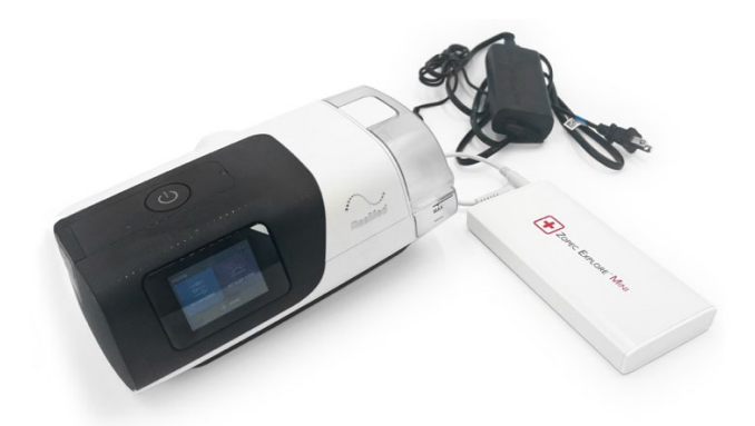
(Diagram C – Zopec Explore ^{TM} Mini connected to the ResMed AirSense 11 in UPS configuration with the AirSense 11 power cord and the ResMed AirMini / AirSense 11 Charging Adapter)