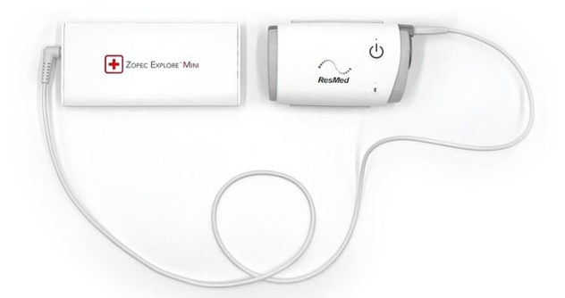
(Diagram B - Zopec Explore™ Mini connected to ResMed AirMini)

Select the DC cable for your device. i.e. ResMed AirMini / AirSense 11 DC Cable. Insert the yellow round pin end of the DC Cable into the DC Output Port of your Zopec Explore™ Mini. Then connect the remaining other end to the power connector port of your PAP device. See diagram (B) below